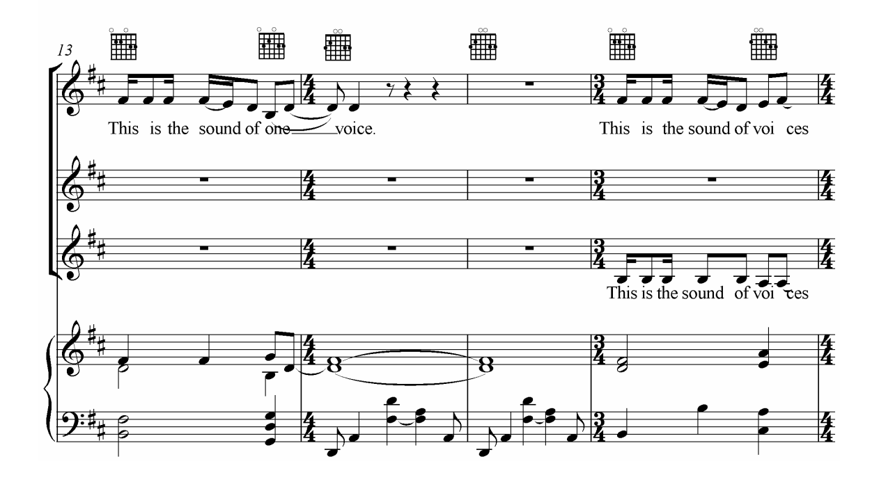
N.B. – For guitars, place capo on 7<sup>th</sup> fret.