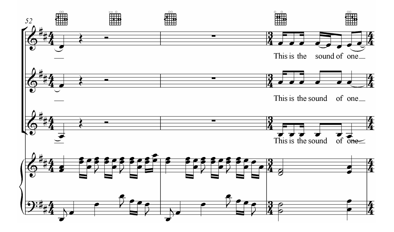
N.B. – For guitars, place capo on 7<sup>th</sup> fret.