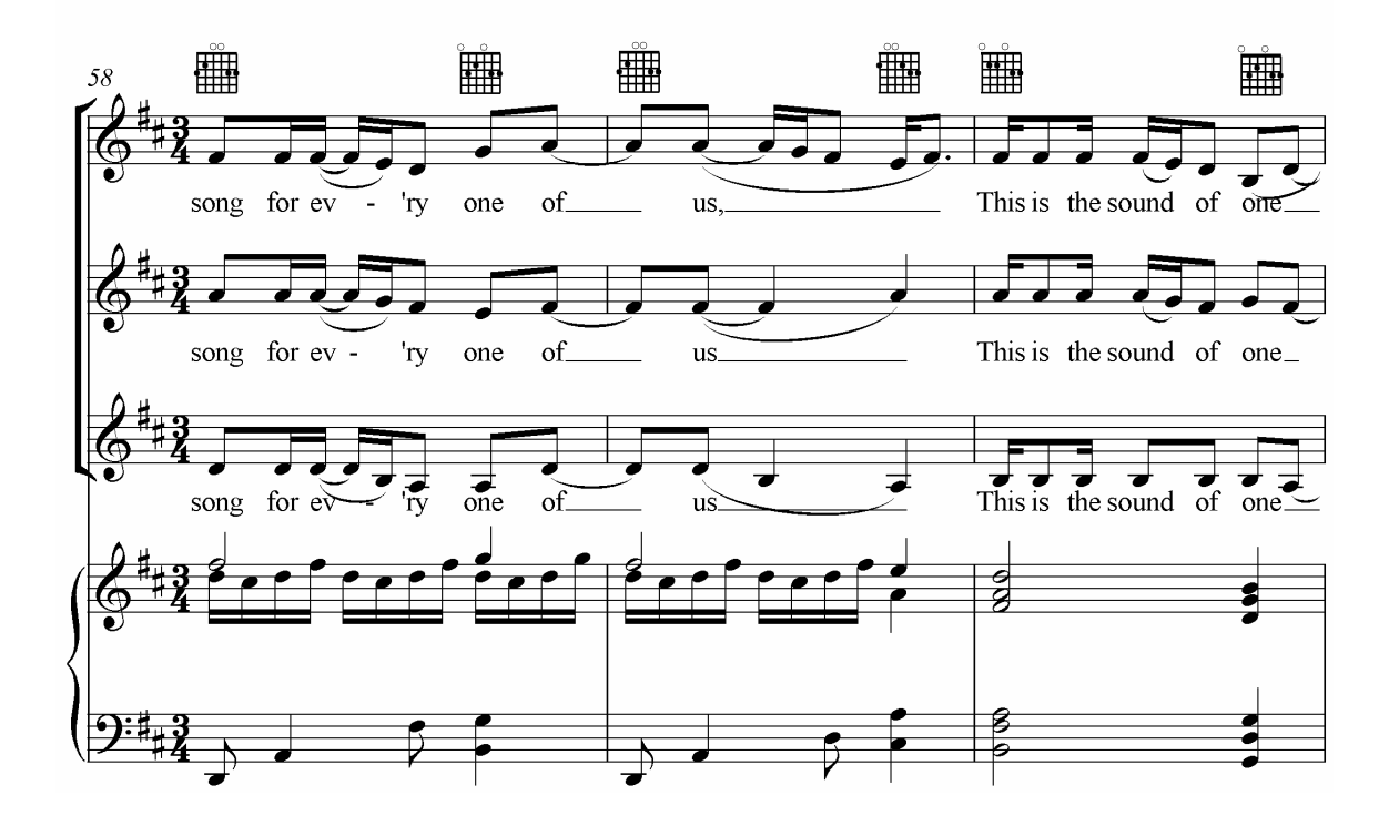
N.B. – For guitars, place capo on 7<sup>th</sup> fret.