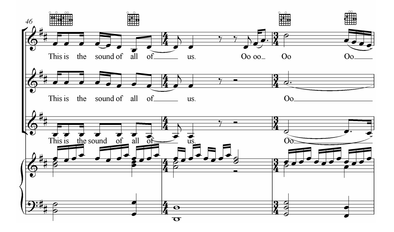
N.B. – For guitars, place capo on 7<sup>th</sup> fret.